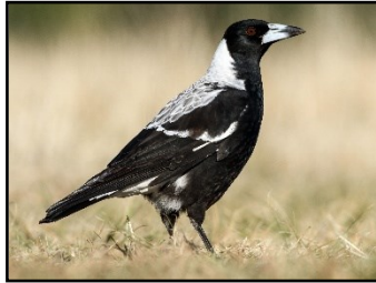
koolbardi - magpie