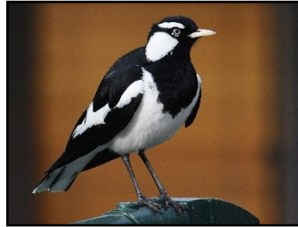
dilaboort - mudlark