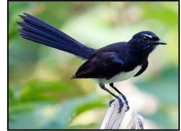
djidi-djidi – willie wagtail