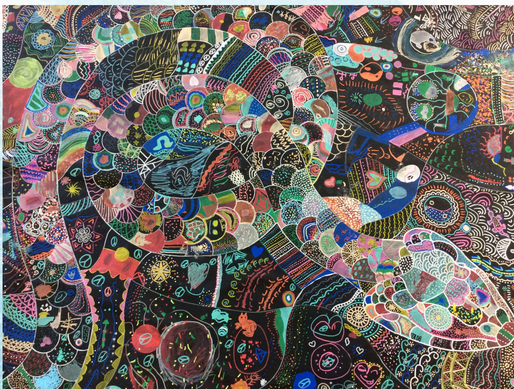
Waakarl - Spirit Snake - by Kamsani Bin Salleh and Winterfold students, NAIDOC 2018